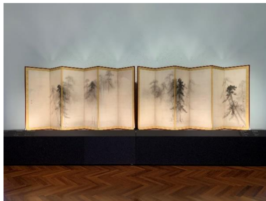
Replicated folding screen lit by Kaneka OLED (Tokyo National Museum main building)