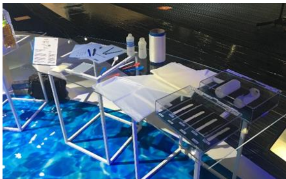
Exhibition of various products made of PHBH

https://g20.org/pdf/topics/jp/others_item.pdf