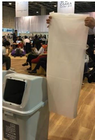
Garbage bags used at the site (made of PHBH)