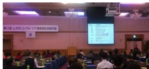
Community dialogue in Kashima

We will continue to promote mutual understanding with local communities through RC activities.