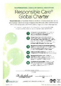
Signed the Responsible Care Global Charter revised in 2014

* Responsible Care refers to actions undertaken on a voluntary basis by the chemical industry to promote improvements in aspects of environmental, safety, and health performance, throughout the entire process from the development of chemical products to their manufacture, usage and disposal. The initiatives and achievements are communicated to the public to raise public confidence in their operations. Kaneka has been actively promoting this approach since 1995 as a founding member of the JCIA Responsible Care Committee (former Japan Responsible Care Council) established by the Japan Chemical Industry Association.