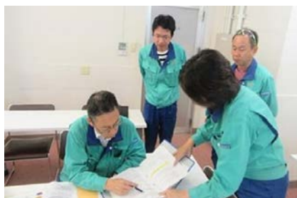
ESG safety and quality inspection