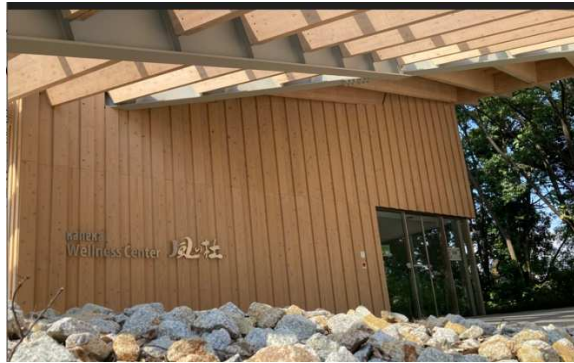
Entrance of Kaze no Mori™

*1. WELL Building Standard is a registered trademark of International Well Building Institute PBC.