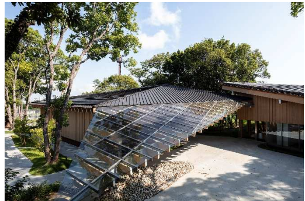
Roofs equipped with VISOLA™ and see-through solar panels