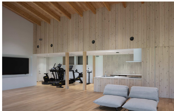
Interior of Kaze no Mori™