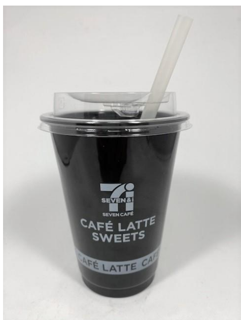
CAFÉ LATTE SWEETS