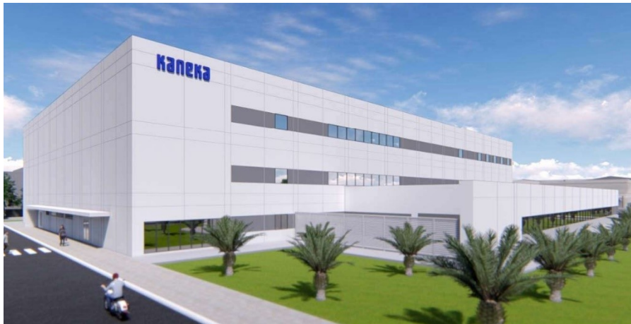
Image of new plant

Description of business: Assembly of medical catheter products