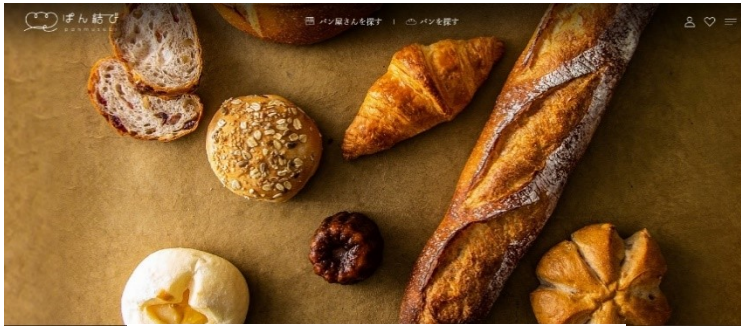
Image of website