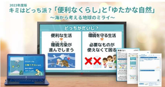
Education program example