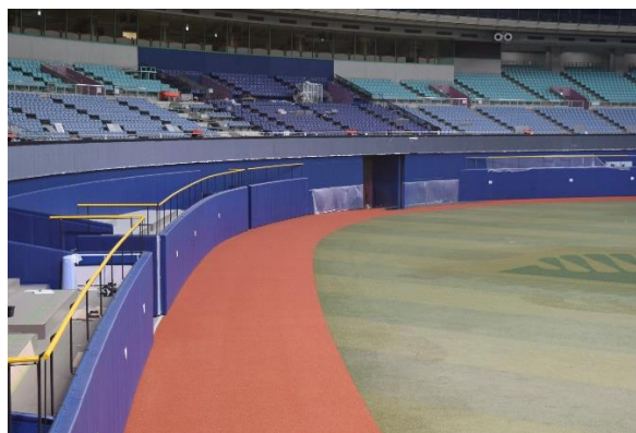
Warning zone at Vantelin Dome Nagoya

(*1) As marine biodegradable artificial turf blades using Green Planet. Based on research by Kaneka